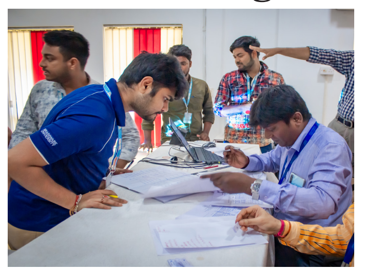
Students registering for blood donation