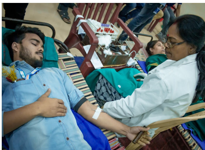
Students donating blood

Nowadays there is so much violence, so much bloodshed. Frequent riots are destroying humanity. On the other hand, initiatives like a blood donation is a helping hand to humanity.