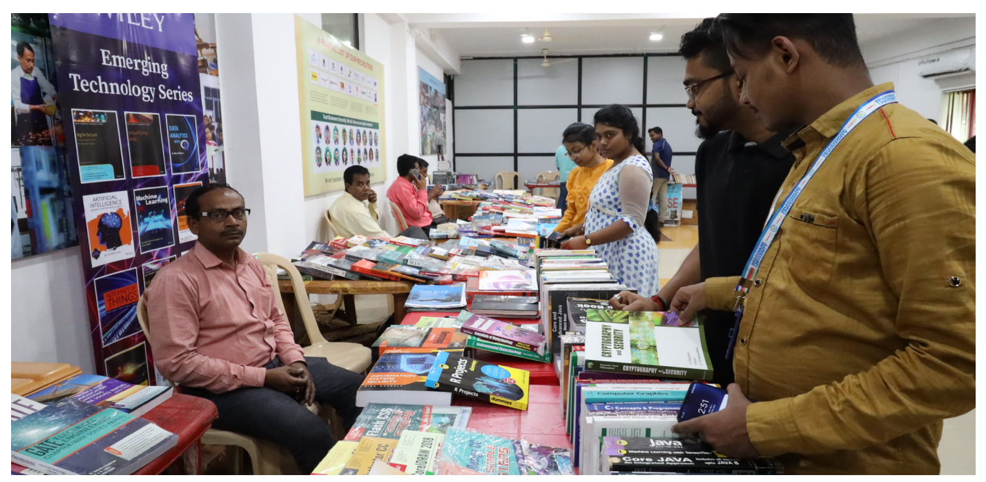
Students at Brainware University's Book Fair

Wonderful news for the bibliophile and the students who love to write. Along with the book fair, the Department of the Library took a step forward with an unique idea of 'e-journal' named 'Brainwave'.